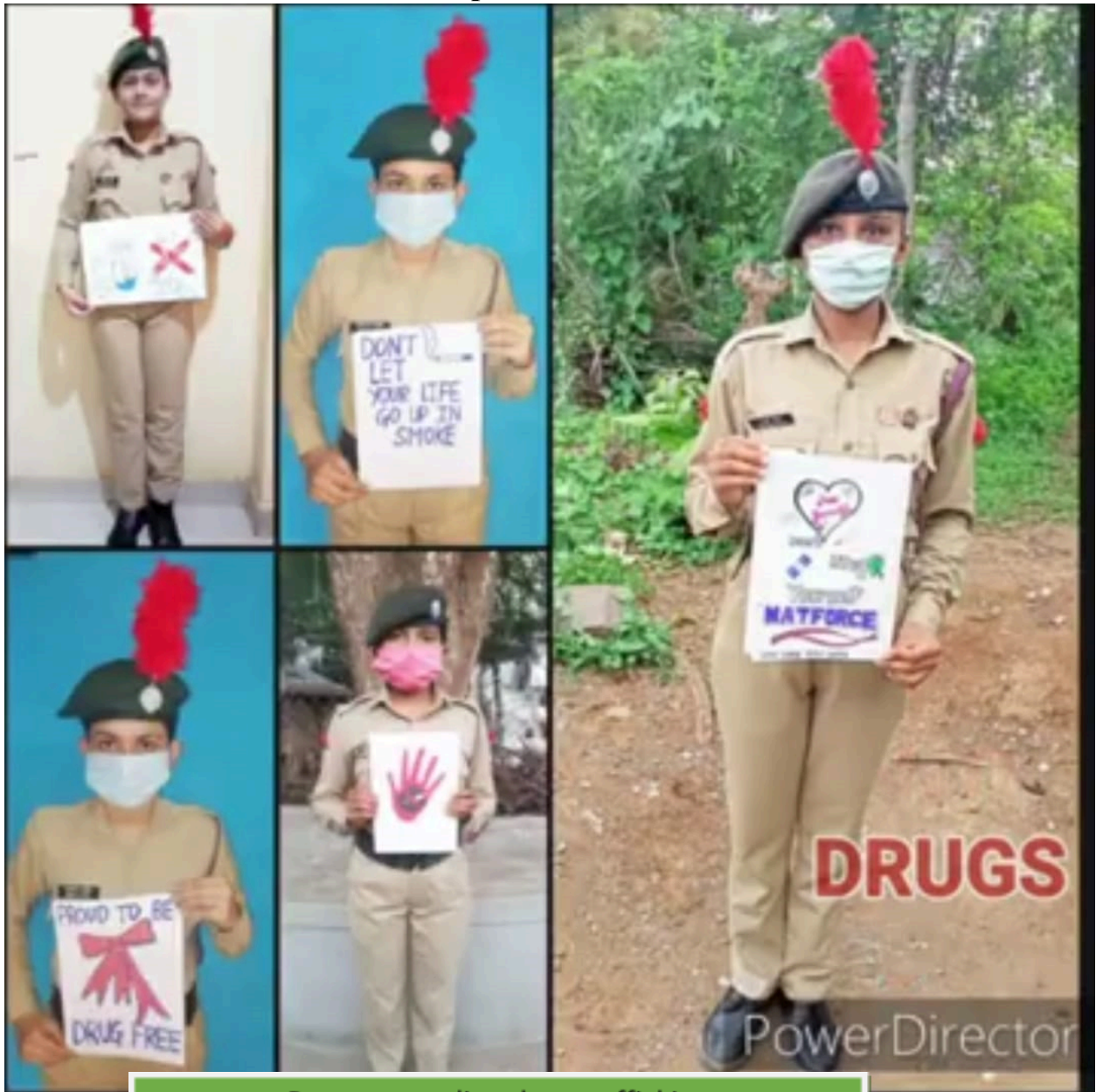
Poster regarding drug trafficking